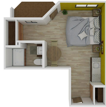
A-2 Studio 425 SQ FT