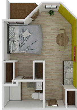
A-5 Studio 400 SQ FT