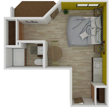
A-2 Studio 425 SQ FT