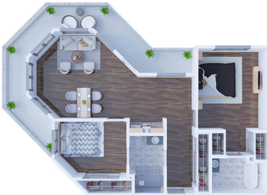
C-1 Two Bedroom 900 SQ FT