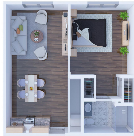
B-6 One Bedroom 600 SQ FT