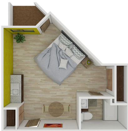
A-7 Studio 460 SQ FT