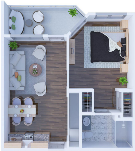
B-1 One Bedroom 550 SQ FT