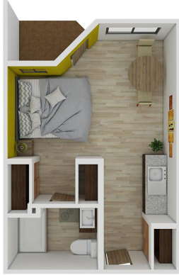
A-1 Studio 400 SQ FT

Solstice Senior Living at Auburn offers several floor plan choices to suit your needs.