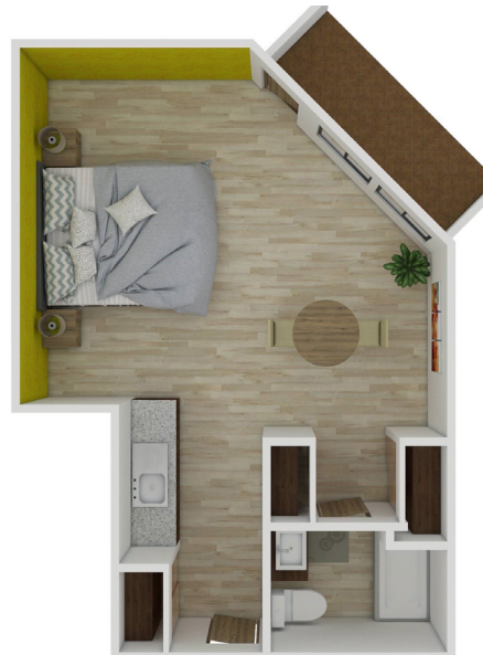
A-8 Studio 600 SQ FT