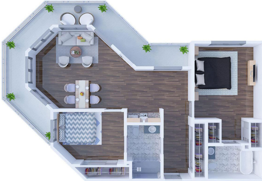
C-1 Two Bedroom 900 SQ FT