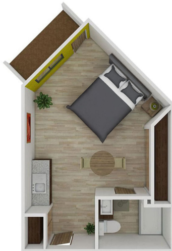
A-6 Studio 460 SQ FT