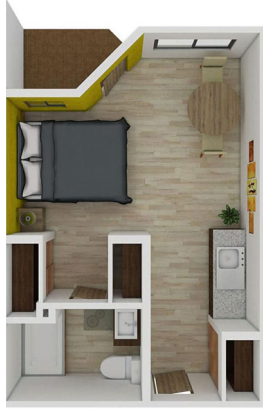
A-1 Studio 400 SQ FT

Solstice at Auburn offers several floor plan choices to suit your needs.