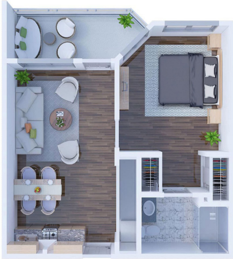
B-1 One Bedroom 550 SQ FT