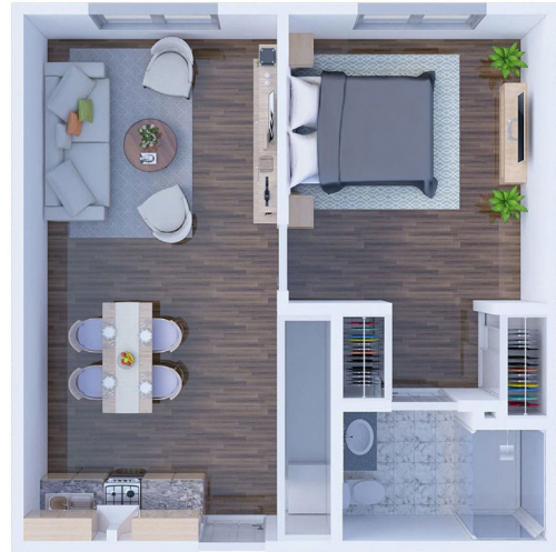
B-6 One Bedroom 600 SQ FT