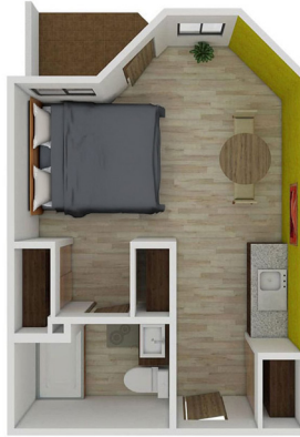
A-5 Studio 400 SQ FT