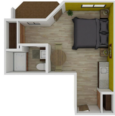
A-2 Studio 425 SQ FT