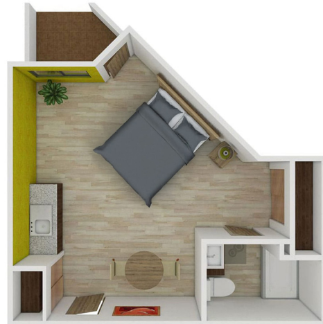
A-7 Studio 460 SQ FT

Solstice at Auburn 3250 Blue Oaks Drive | Auburn, CA 95602 530.888.1144 SolsticeAtAuburn.com